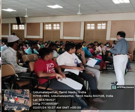
Udumalaipettai, Tamil Nadu, India H7H8+992, Udumalaipettai, Tamil Nadu 642128, India Lat 10.578052° Long 77.265538° 02/01/24 10:27 AM GMT +05:30