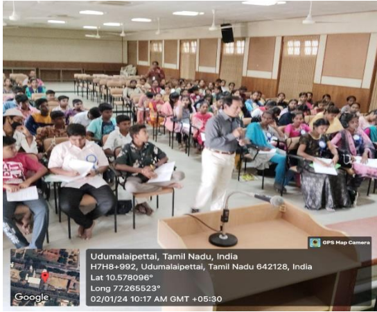
Udumalaipettai, Tamil Nadu, India H7H8+992, Udumalaipettai, Tamil Nadu 642128, India Lat 10.578096° Long 77.265523° 02/01/24 10:17 AM GMT +05:30